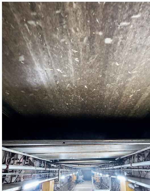
without impress products brown steel belt with adhesive flakes (bad function)