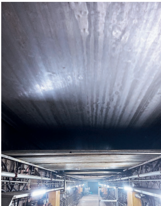
with impress iCR971 (clean steel band without gluing)