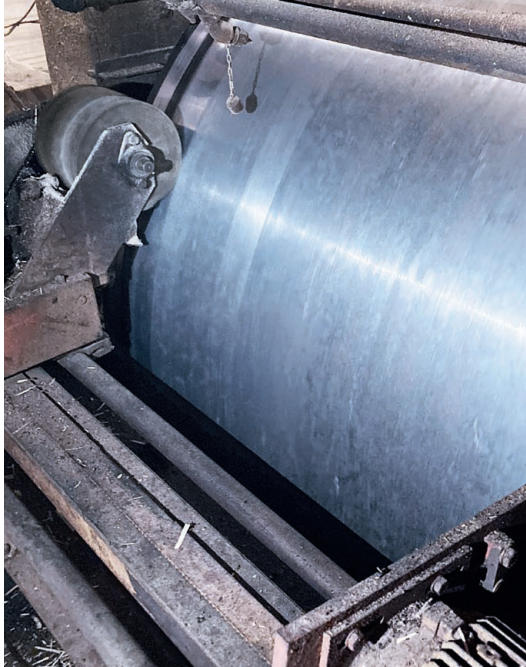
with impress iCR971 (clean steel band without gluing)

is an external release agent developed exclusively for use with isocyanate glues. It is suitable for high requirements on release and cleaning activity. It is compatible with all grades of dilution water. The wetting properties are optimized and it is suitable for roller and spraying application.