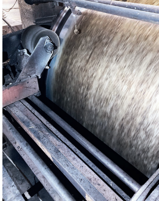
without impress products brown steel belt with adhesive flakes (bad function)